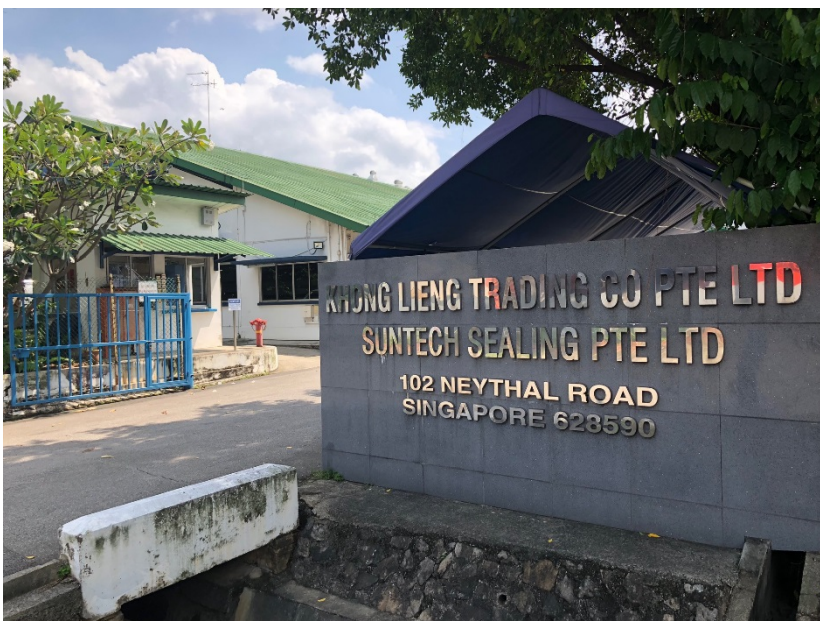
Image of KLT Group Factory

KLT Group imports seals and gaskets, which fill the space between mating surfaces of piping to prevent leakage and contamination from the joint section, and distributes with custom fabrication services based on customer needs to a wide range of industrial customers, such as a refinery, plant and vessel and so on in Southeast Asia, especially in Singapore.